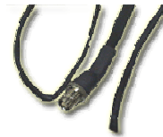
1A005 Antenna Article number : 0358.762-952