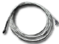
1K043 Temp. Sensor Article number : 0878.170-955