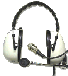
1PH024 Headset Article number : 0860.549-951