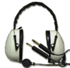
1PH028 Headset Article number : 0860.557-951