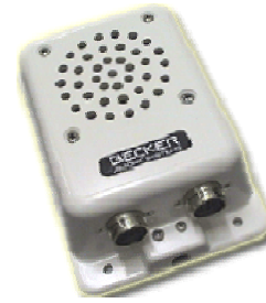
1PL042 Loudspeaker and Distribution Box Article number : 0879.312-951