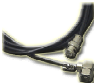
1KA003 Antenna cable, length 2.5 m Article number : 0267.082-950