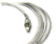
1US070 PTT Switch Article number : 0431.011-952