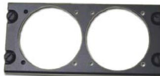
1E025 DZUS, Twin-Panel Article number : 0780.790-254