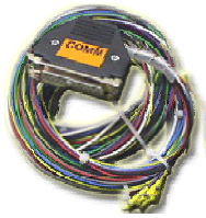
1K042 Cable harness Article number : 0877.476-950