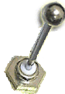
1A032 Transponder antenna KEC-KC-89 (BNC) Article number : 0707.007-952