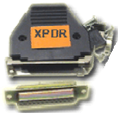
CK4401-S Connector kit Article number : 0552.801-954