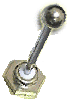
1A032 Transponder antenna KEC-KC-89 (BNC) Article number : 0707.007-952