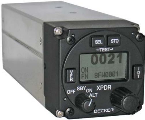
BXP6401-2-(01) Full solid state MODE-S Transponder, Class 2 Article number : 0588.709-915