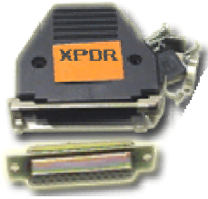
CK4401-S Connector kit Article number : 0552.801-954