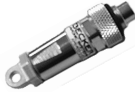
AM6400-1-(01) Address module Article number : 0572.942-915