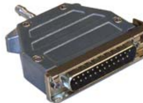
BE6400-01-(01) Blind Encoder Article number : 0592.137-915