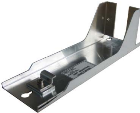
MK4401 Mounting Kit for the BXP6401-1R Remote controlled MODE-S Transponder Article number : 0556.726-284