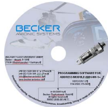
AMP6400-1 Address Module program kit Includes Software and cable Parallel interface Article number : 0584.843-954