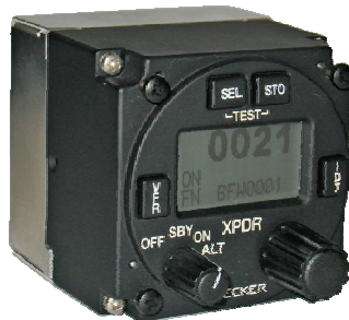
CU6401-1-(01) Control unit for remote-controlled MODE-S Transponder BXP 6402-1R-(01) Article number : 0572.896-915